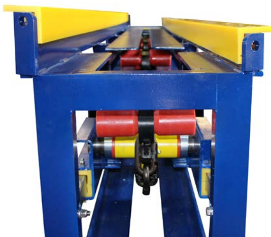
WIDER ENTRANCE RAILS - FROM 13" TO 16"