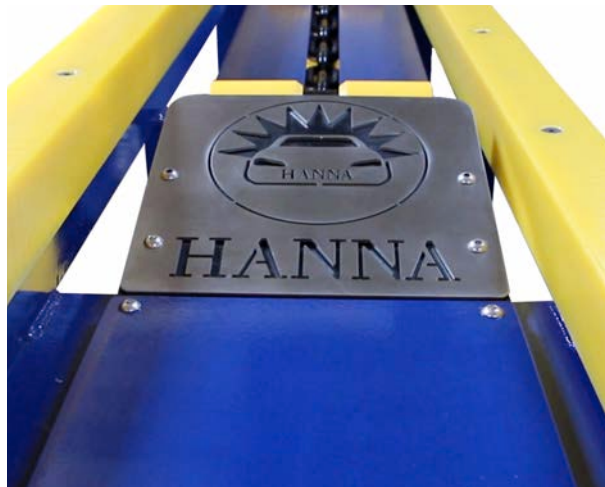
EZ-UP ENTRANCE DOOR™