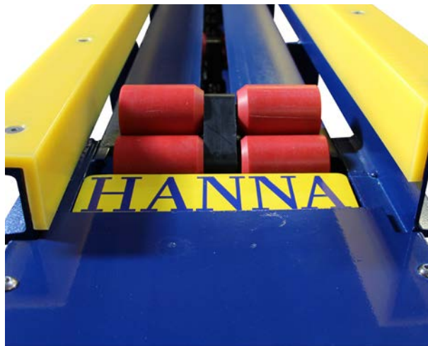
DISAPPEARING EXIT DOOR™